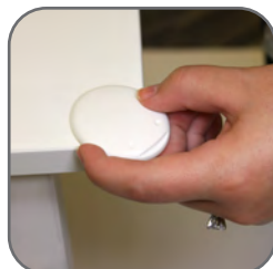
Press firmly for 30 seconds. Leave for 24 hours to set for maximum adhesion.