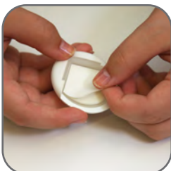
Remove Protective Liner