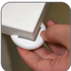
Attach Corner Protector by lining up the inner corner with table/furniture corner.